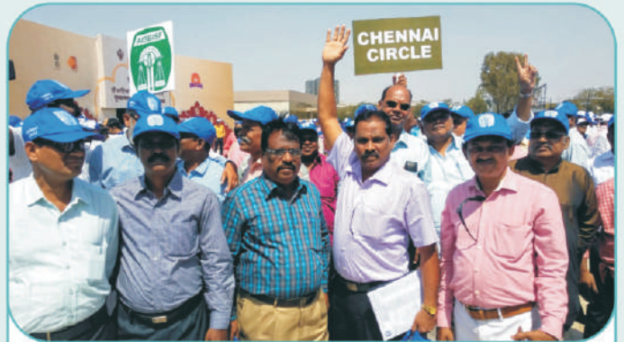
Procession commencement at the Federation Conference at Ahmedabad