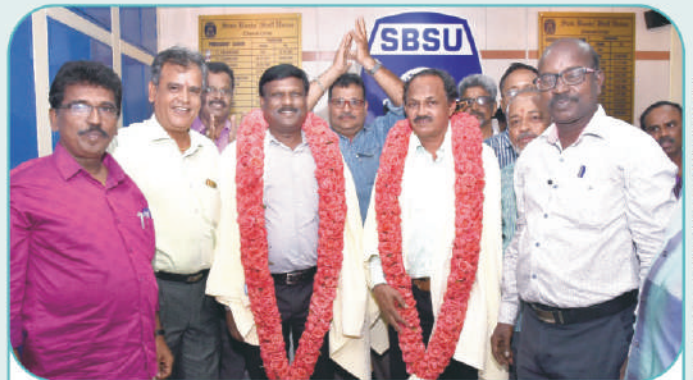
On the occasion of taking charge as President