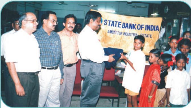
Community Services Banking programme at a village near Tiruvallur