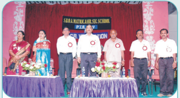
On the occasion of PTA day of SBOA Matriculation as Vice President of PTA