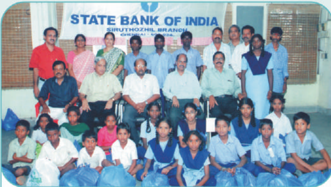
School children from a nearby village given sweets on the occasion of Deepavali