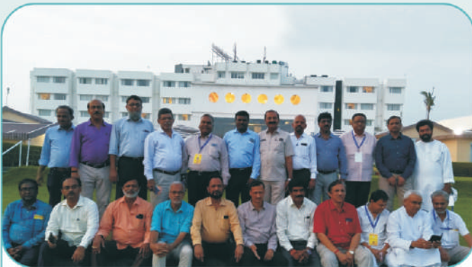
With the Leaders of our Federation at Bhubaneswar